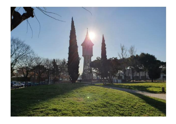
👉 Parc de Catalunya