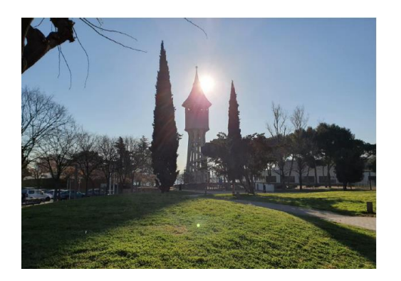
👉 Parc de Catalunya