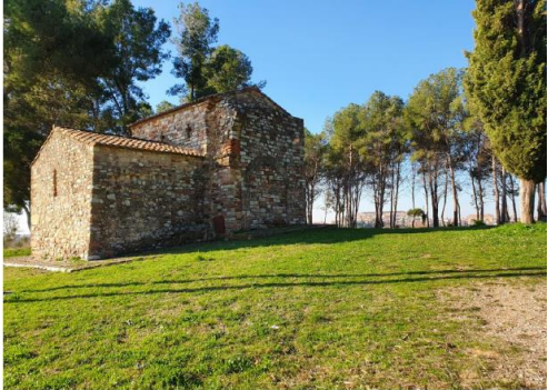
← Capella de Sant Nicolau