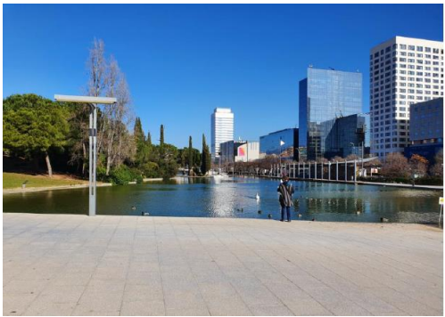
← Parc de Catalunya