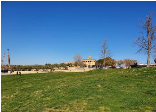
← Can Gam bús