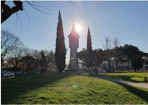
← Torre de l'aigua