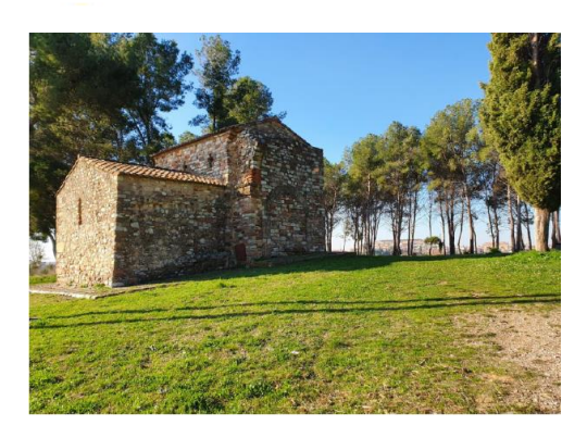
👉 Capella de Sant Nicolau