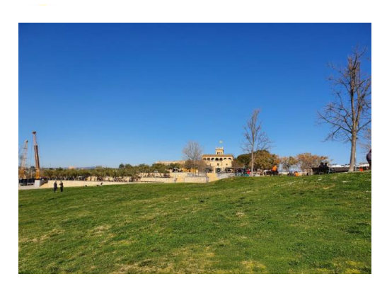
👉 Can Gam bús