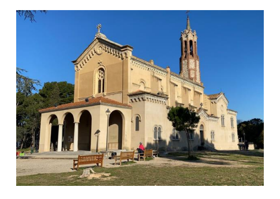
👉 La Salut