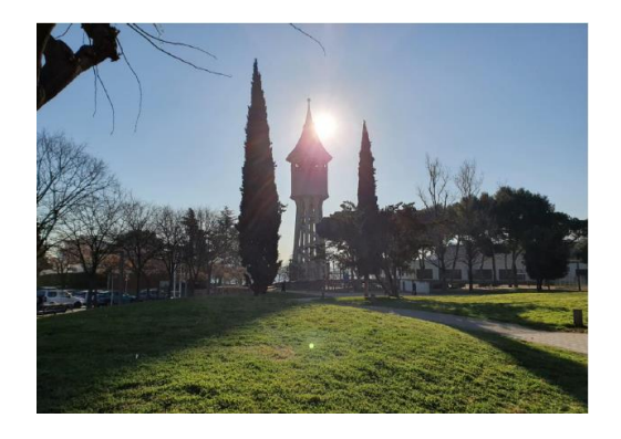
👉 Torre de l'aigua